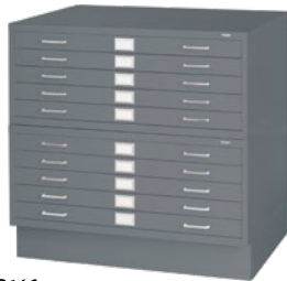
OB146 • Two units stacked