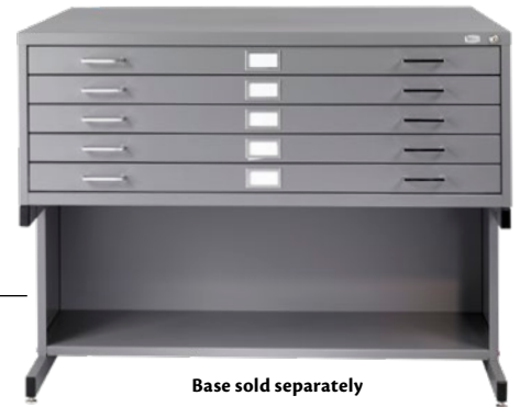
Base sold separately