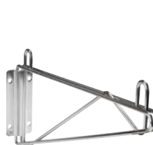
RL612 Single Shelf Support