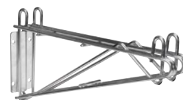
RL613 Double Shelf Support